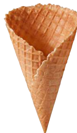
DANISH CONE SUPER 90/160