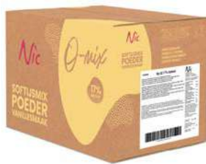
02 17% FAT BOX 7 X 2 KILO 82020