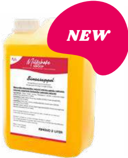
ORANGE 3 CANS X 2 LITER 60830

Encourage your guests to choose a milkshake and keep things exciting with a variety of flavours. With our wide range of milkshake syrups, you'll keep surprising every customer, ensuring they come back time and again to try the newest flavours!