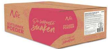
YOGHURT 13% FAT BOX 10 X 1 KILO 43750