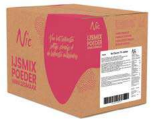
(D)ROOM 18% FAT BOX 14 X 1 KILO 43820