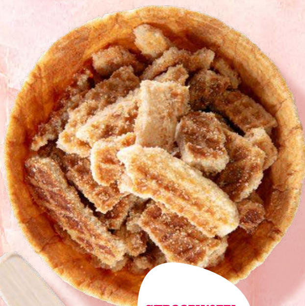
STROOPWAFEL PIECES TUB 750 GRAM 1760