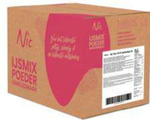
FLEVO 16,4% FAT BOX 14 X 1 KILO 82040