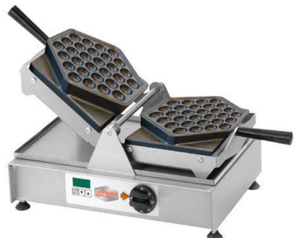
BUBBLE WAFFLE MAKER DIAMOND SERIES 93025