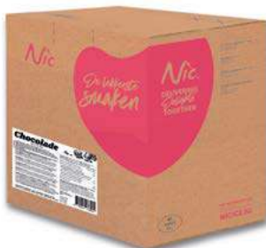
CHOCOLATE 7% FAT 1 X 10 LITER / 11 KILO 43690