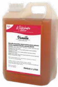
VANILLA 5 CANS X 2 LITER 60200