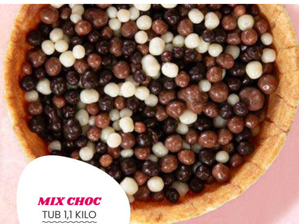
MIX CHOC TUB 1,1 KILO 1100