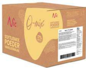
01 17% FAT BOX 14 X 1 KILO 82010

With Nic's premium ice cream mixes, you're delivering consistently delicious soft serve that keeps customers coming back. Each vanilla blend offers a distinct, memorable flavour.