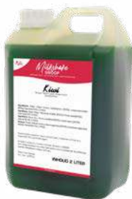
KIWI* 5 CANS X 2 LITER 60240