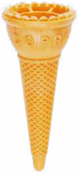
KIDS CONE 46/115 168 PIECES 51105

From Classic to Crunchy: Our wide range of cones turns every soft serve into a special moment.