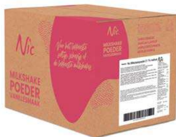
MILKSHAKE MIX POWDER Z1 7% FAT 14 X 1 KILO 82060