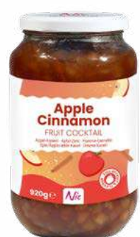
APPLE-CINNAMON 6 JARS X 920 GRAM 55040