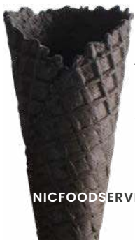
BLACK CONE WITH VANILLA FLAVOUR 48/155 140 PIECES 51097