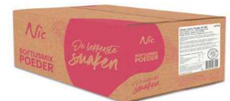
BLACKCURRANT 4% FAT BOX 10 X 1 KILO 43740