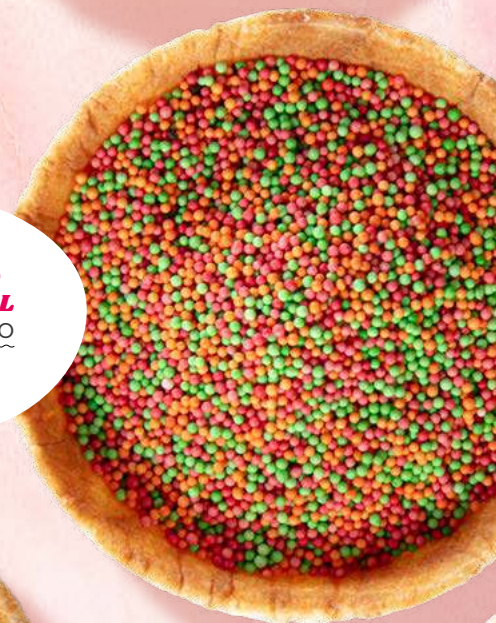
DISCO SPECIAL TUB 2 KILO 1220