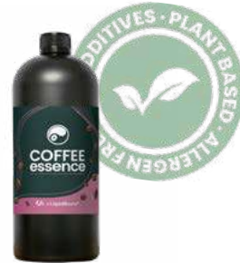
LIQUIDBEANS® COFFEE ESSENCE 6 BOTTLES X 900 ML 60900