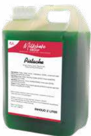
PISTACHIO* 5 CANS X 2 LITER 60470