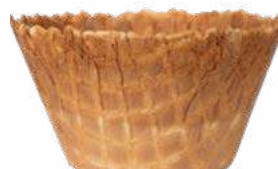
DANISHCUP LARGE 95/55