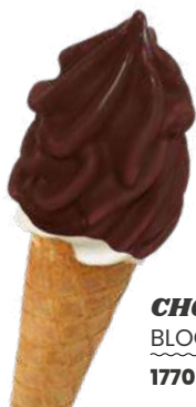
CHOCO-BLOCK DARK BLOCK 5 KILO 1770

Let your guests choose from a range of tempting flavours and cover the soft serve with the dip. The result? An irresistible treat with extra crunch and flavour. As the dip naturally hardens on the soft serve, it creates a unique contrast in texture that's both unexpected and delicious.