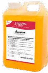
BANANA 5 CANS X 2 LITER 60220