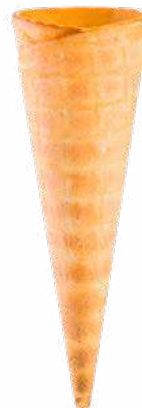
LUXURY CONE 45/135 240 PIECES 51129