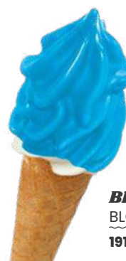
BLUE MONSTER-BLOCK BLOCK 5 KILO 1910