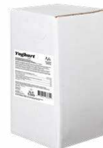
YOGHURT 3,5% FAT 1 X 5 LITER / 5,5 KILO 43662