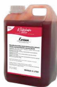
CHERRY 5 CANS X 2 LITER 60310