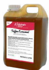
TOFFEE CARAMEL 5 CANS X 2 LITER 60490