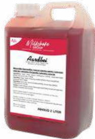
STRAWBERRY 5 CANS X 2 LITER 60210