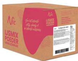
CREAM 26% FAT BOX 12 X 1 KILO 82030