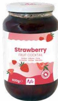
STRAWBERRY 6 JARS X 920 GRAM 55050

Timeless favourites, now in handy packaging*