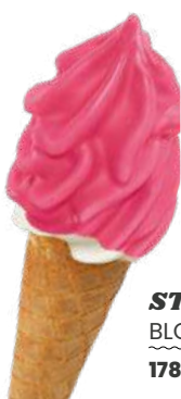
STRAWBERRY-BLOCK BLOCK 5 KILO 1780