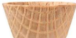
DANISH CUP MEDIUM 93/45