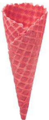
RED CONE WITH RASPBERRY FLAVOUR 48/155 140 PIECES 51096