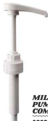
MILKSHAKE PUMP COMPLETE 60205