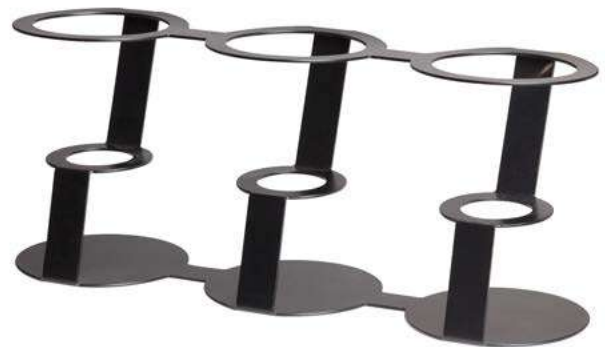
BUBBLE WAFFLE STANDARD 3-SECTION 93030