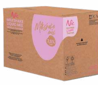
MILKSHAKE MIX LIQUID 2,5% FAT 1 X 10 LITER / 11 KILO 70030