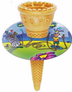
KIDS CONE PACKAGE 168 CONES AND 100 DRIP CATCHERS 51100