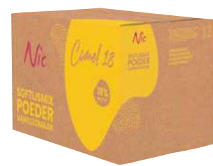
COMEL 18 18% FAT BOX 14 X 1 KILO 43810