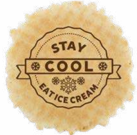
DUCATO STAY COOL Ø 60 1000 PIECES 51126