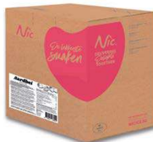
STRAWBERRY 6% FAT 1 X 10 LITER / 11 KILO 43694