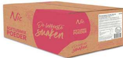
BANANA 10% FAT BOX 10 X 1 KILO 43730