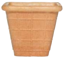
SQUARE CUP 56/48 304 PIECES 51133