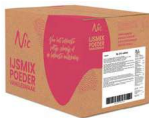
24% 24% FAT BOX 12 X 1 KILO 82050