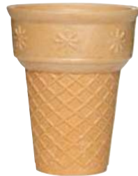
GIANT CUP 68/72 120 PIECES 51134