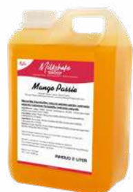
MANGO PASSIONFRUIT 5 CANS X 2 LITER 60510