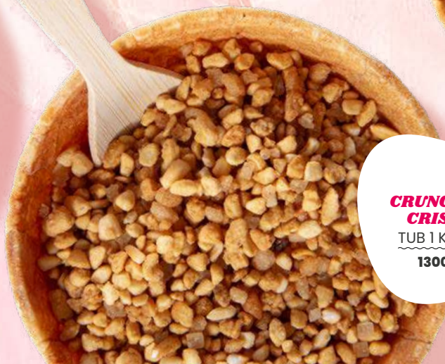
CRUNCHY CRISP TUB 1 KILO 1300