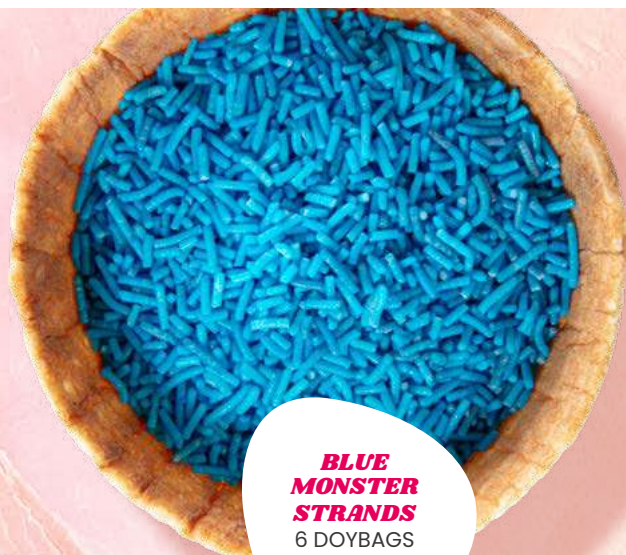
BLUE MONSTER STRANDS 6 DOYBAGS X 1 KILO 1510