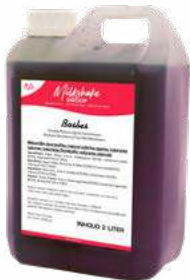
BLUEBERRY 3 CANS X 2 LITER 60770