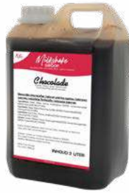
CHOCOLATE 5 CANS X 2 LITER 60230