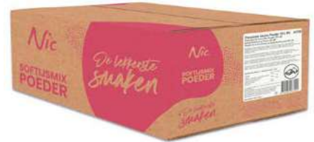
CHOCOLATE 10% FAT BOX 10 X 1 KILO 43720