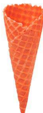
ORANGE CONE WITH ORANGE FLAVOUR 48/155 140 PIECES 51098