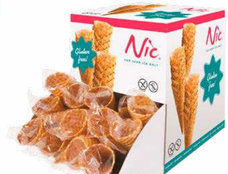
GLUTENFREE CONE 54/140 2 X 52 PIECES 51128