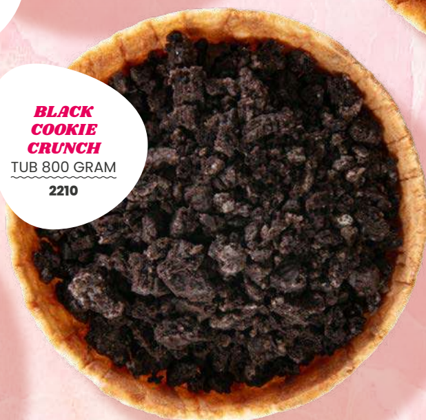
BLACK COOKIE CRUNCH TUB 800 GRAM 2210