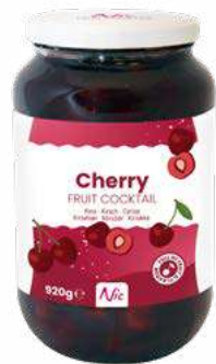
CHERRY 6 JARS X 920 GRAM 55020