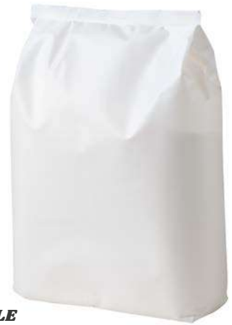
BUBBLE WAFFLE MIX 8 X 1 KILO 51131