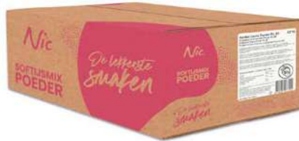
STRAWBERRY 5% FAT BOX 10 X 1 KILO 43710