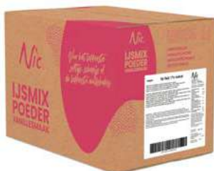
RELIZ 17 17% FAT BOX 14 X 1 KILO 43830