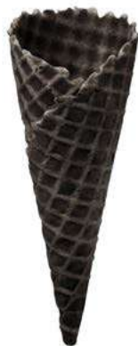
BLACK CONE WITH VANILLA FLAVOUR 48/155 140 PIECES 51097