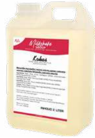
COCONUT 5 CANS X 2 LITER 60290