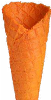
ORANGE CONE WITH ORANGE FLAVOUR 48/155 140 PIECES 51098