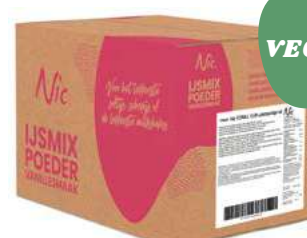
FORALL 15,9% FAT BOX 14 X 1 KILO 43840