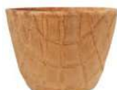
DANISH CUP MINI 53/39