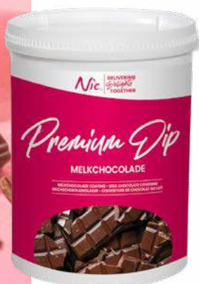
MILK-CHOCOLATE 6 JARS X 1,2 KILO 2800