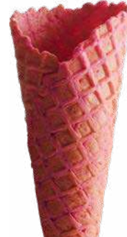
RED CONE WITH RASPBERRY FLAVOUR 48/155 140 PIECES 51096