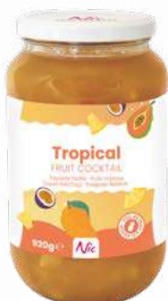
TROPICAL 6 JARS X 920 GRAM 55030