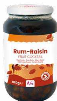
RUM-RAISIN 6 JARS X 920 GRAM 55010