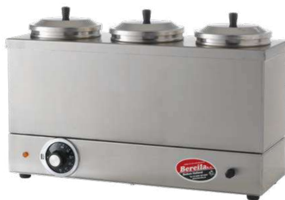
AU-BAIN-MARIE DISPENSER 3-SECTION 95160

Dip sensation for every season. A crispy layer to complete your soft serve.