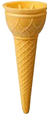
TRADITIONAL CONE 50/114 168 PIECES 51107